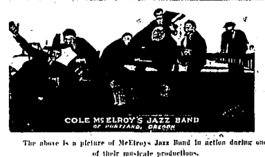
The above is a picture of McElroy's Jazz Band in action during one of their musical productions.