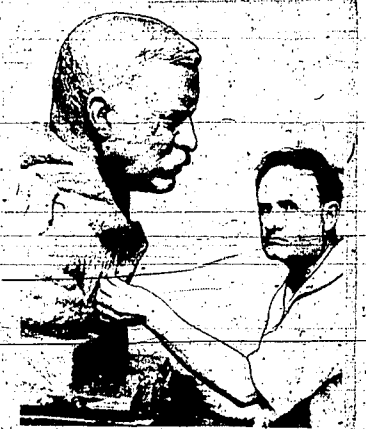
James E. Fraser, sculptor, working on the bust of Roosevelt for the Santiago monument.