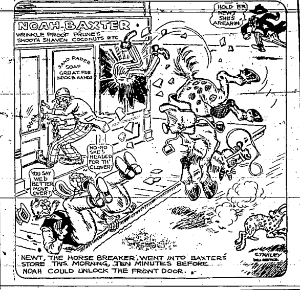
NEW! THE HORSE BREAKER WENT INTO BAXTERS STORE THIS MORNING, TEN MINUTES BEFORE NOAH COULD UNLOCK THE FRONT DOOR.