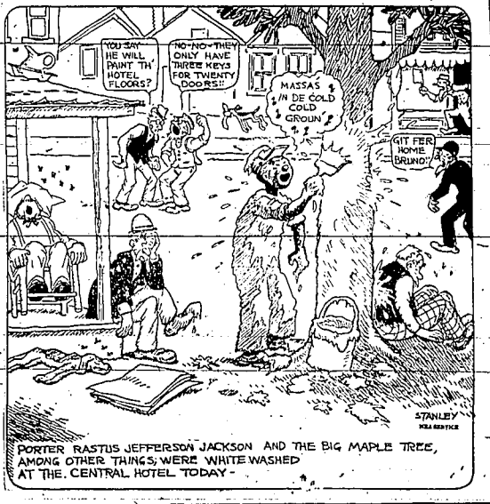
PORTER RASTUS JEFFERSON JACKSON AND THE BIG MAPLE TREE, AMONG OTHER THINGS, WERE WHITE WASHED AT THE CENTRAL HOTEL TODAY.