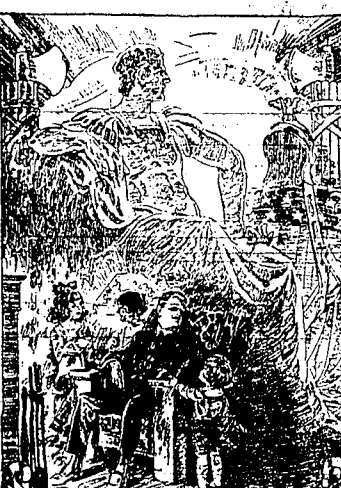
In America government was created for the purpose of protecting its citizens