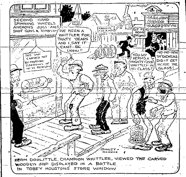
HERM DOG LITTLE CHAMPION WHITTLED WOOD PRESERVATIVE IN A BOTTLE IN TOBEY HOUSTONS STORE WINDOW