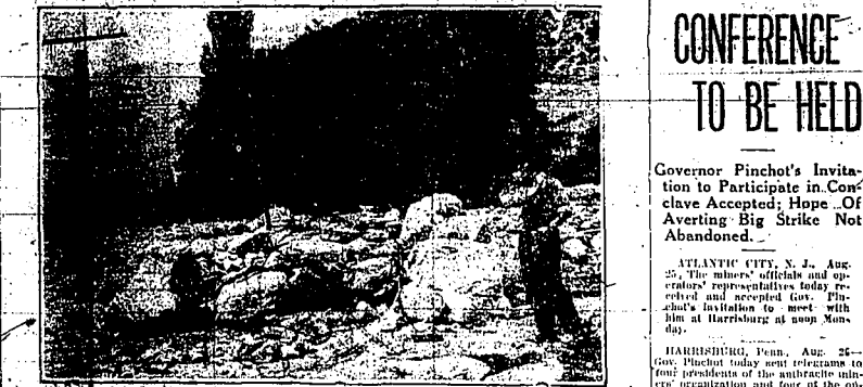
Nine bodies of campers have thus far been recovered on the Lincoln highway between Salt Lake City and Ogden, Utah, following a cloudburst recently. Huge boulders were washed into the canyon through which the highway runs. Traffic was blocked for four days.