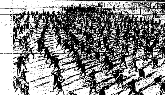
DOING THEIR "DAILY DUTY" These orphans wash of the year that relief use the beach as their playground. They are part of the orphan colony brought from Anatolia and sheltered in the Near East Relief orphanage at Los Angeles in Greece.