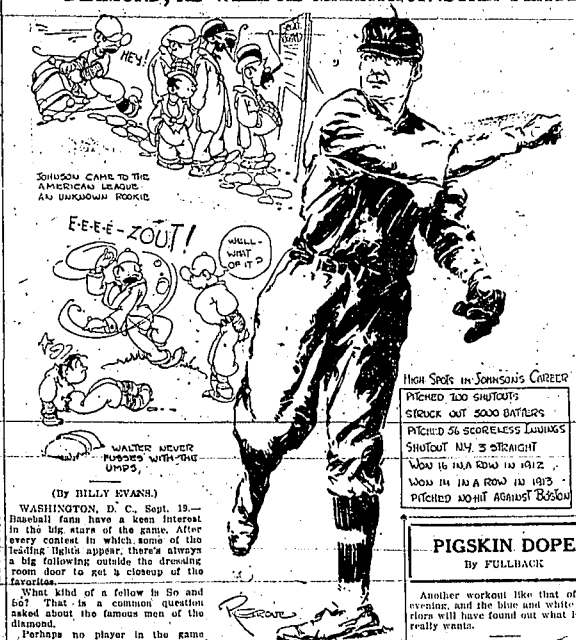
WASHINGTON LEAGUE TO THE AMERICAN CAME AN UNKNOWN ROOKIE