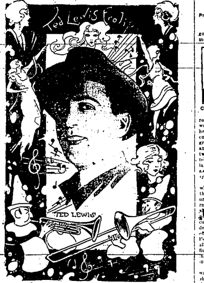
Ted Lewis, Saxophone Expert, Presents Unique Star

Jazz is the theme and the star of the Ted Lewis Frotica Broadway's newest musical review. In spite of the way it has swept the country, jazz has never been so lauded before. The reason this time in Ted Lewis, who you might say, is the star of its originators. Certainly no other person has done so much to advance the cause of jazz as this Ted Lewis, whose audience consists of many thousands of phonautograph horns as well as those who see him in person. "I have spent all the years of my saxophone career finding out why the public takes to the saxophone and what it is that gives the kick in saxophone music," he declared. "I have discovered that people can be divided into two types, those who like it because it is so different and those who like the sentimental and soothing. Jazz can feel them both. "Personally, I prefer a song that tells a story, a story with a picture and a story with humor. I have just recorded one called 'Hi Ho Hi Lo' that gives the experience of a German band in 'Hunk'. The tale of these fat, pompous musicians falling in love with dainty, blond eyed 'Hunk' girls is bound to get a laugh."