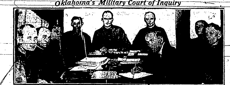
This is Governor Walton's martial law agency of investigation into activities of the Ku Klux Klan in the state. During its four weeks of existence the court has examined more than 500 witnesses and taken some 600 pages of testimony.

INSURANCE IN BIG BUSINESS Forteen Chicago Business Men Carry Politics Amounting to $15,000,000 for Benefit of Consumers.