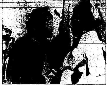
Jim Bridger and Yellow Galf in "The Covered Wagon," Which Appears at the Laving Theatre, October 29-31.

For Constipation, Biliousness, Indigestion, Headache, and all ailments of the bowels. Sold by druggists everywhere.