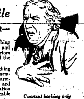
Constant coughing only makes a cough worse.