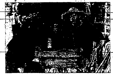
Ernest Torrence and Tully Marshall in "The Covered Wagon" at the Laving Theatre, October 29-31.