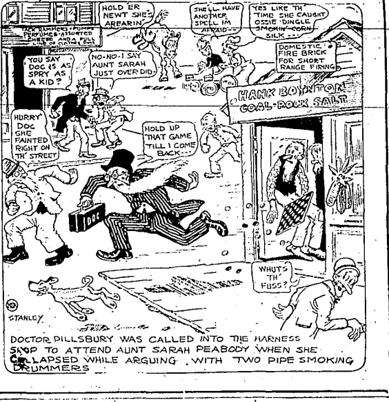
DOCTOR PILLSBURY WAS CALLED INTO THE HARNESS SCOP TO ATTEND AUNT SARAH PEABODY WHEN SHE COLLAPSED WHILE ARGUING WITH TWO PIPE SMOKING DRUMMERS