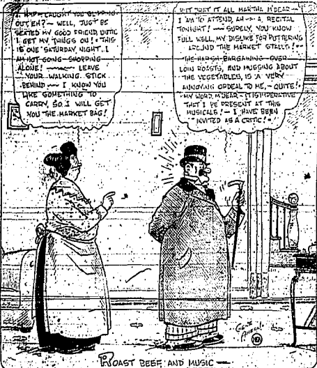
ROAST BEEF AND MUSIC