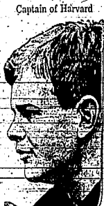
Captain of Harvard

Sports for Women. Among the sports recommended for women are: golf, tennis, football, basketball, baseball, track and field sports, women's swimming, polo, polo-wrestling and tug-of-war.