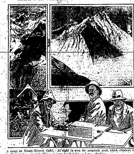
A camp on Mount Everest (left). At right is seen the mountain peak, which climbers seek to reach. In foreground, Captain Irvine (center in sketch), and two climbers.