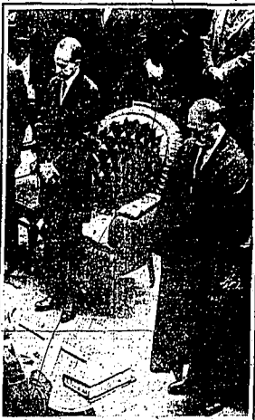
Officials of the government met in the home of President-elect Harding in memory of the late President Harding. Photo shows President Coolidge (left) and Chief Justice Taft with hunch heads as prayer was being said.

"Cold wave causes rush to tropics," says a headline over shipping news, but more likely the rush is of the kind which Old Farmer's Almanac could predict as the "about this time," in any case the voyagers to tropic seas may wish they had waited another week if they run into the northeaster that is moving up from Alabama.