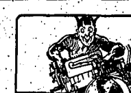
Don't let Friction warm your motor

Avoid excessive "racing" of a cold motor. As soon as it takes hold, throttle down and retard the spark for a few minutes. This gives the oil a chance to reach the bearing surfaces before they become overheated from friction.