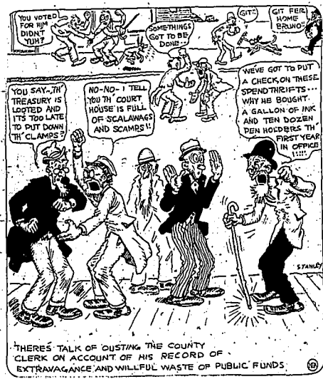
THERE'S TALK OF OUSTING THE COUNTY CLERK ON ACCOUNT OF HIS RECORD OF EXTRAVAGANCE AND WILLFUL WASTE OF PUBLIC FUNDS.