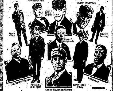
Here are the umpires of the National League, all former stars of the game, and now the lowest stratum of the national game. Each is identified on the photograph.