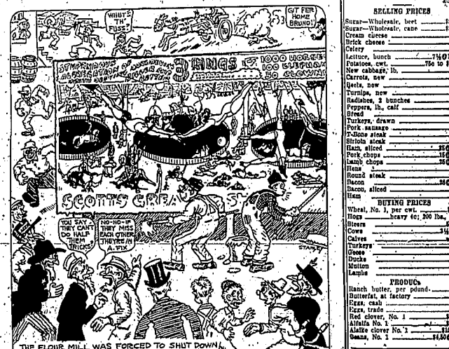
THE FLOUR MILL WAS FORCED TO SHUT DOWN TODAY BECAUSE THE BOYS WENT OUT TO WATCH THE BILL POSTERS PUT UP A LOT OF NEW CIRCUIT PICTURES