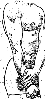
(c) by Herman Macdonald

For better health suggest of arm: Place left hand over right wrist in position illustrated, then, without closing shoulders or side, flex right arm until right hand is brought up to the shoulder, maintaining the movement with left arm. Alternate with other arm.