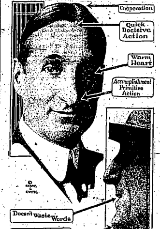
By DR. W. M. MARSTON. "When you think McAdoo has a singularly firm, compact face and head, his chin exerts some impediment to rapid executive action, but not enough to let him limp in any great difficulty."