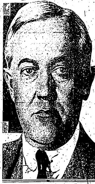
John W. Davis, Former Ambassador to England.