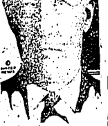
At South of New York, who's number second for nomination today.