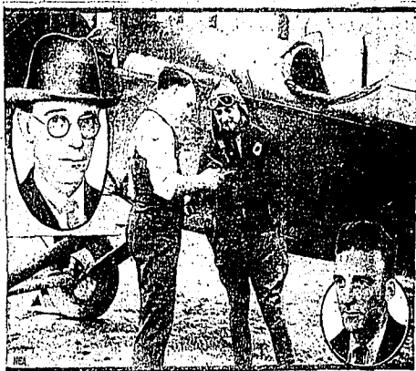
Those men play an important part in Uncle Sam's Air Mail Service, and they aren't aviators, either.