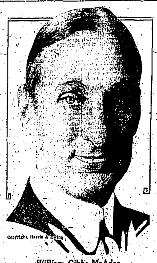
William Gibbs McAdoo