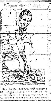
Woman Shoe Pitcher