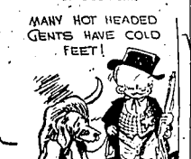
MANY HOT HEADED GENTS HAVE COLE FEET!