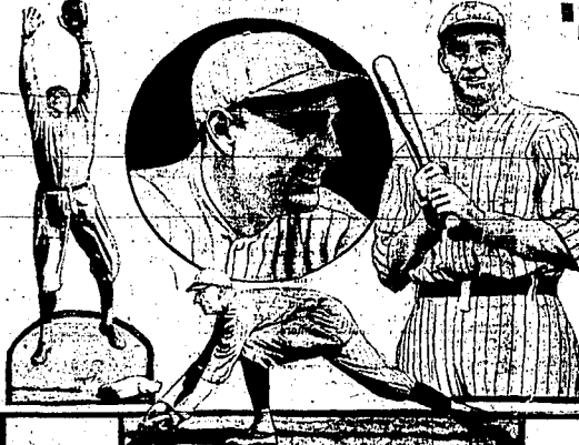
This first baseman is the marvel of baseball this year. He hit three home runs and batted in the eight runs he hit against the Reds on July 14. He is hitting .372. His fielding is uncanny.

Long George Kelly, first baseman of the New York Giants, is the marvel of baseball this year. He hit three home runs and batted in the eight runs he hit against the Reds on July 14.