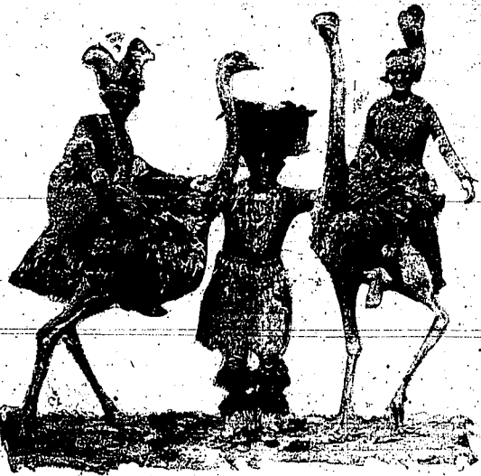
The Racing Ostriches with the Al G. Barnes Circus, Coming to Twin Falls, Thursday, Sept. 4. The Riders Are the Australian Kangaroos.