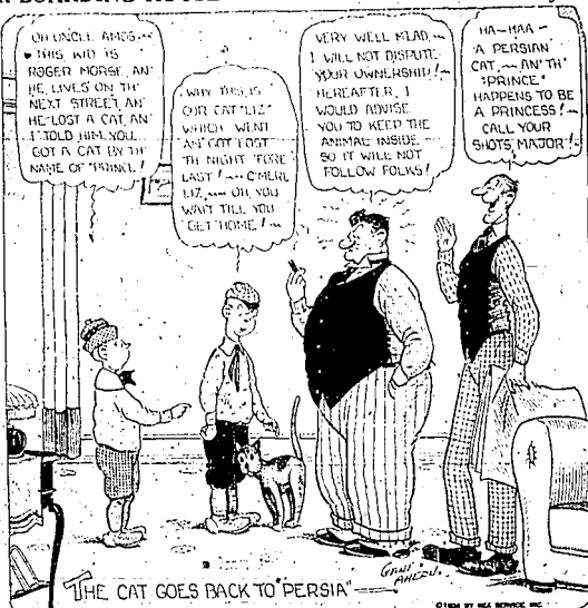
THE CAT GOES BACK TO PERSIA