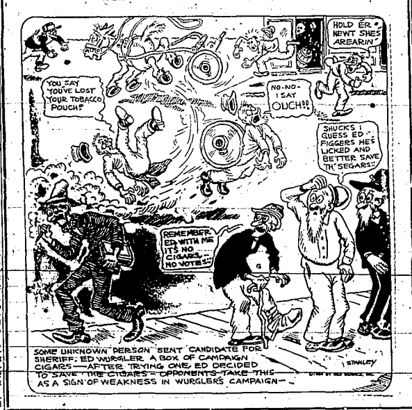
SOME UNKNOWN PERSON SENT CANDIDATE FOR SHERIFF ED WUGLER A BOX OF CAMPAIGN CIGARETTES - AS THEY TRY TO DECIDE TO SIGN THE CIGARETTES - OPPONENTS TAKE THIS AS A SIGN OF WEAKNESS IN WUGLER'S CAMPAIGN -