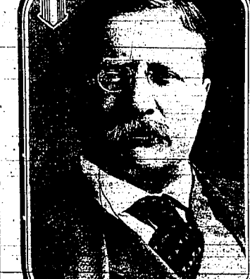
Today is the birthday anniversary of Theodore Roosevelt, our American leader and patriot. The above photograph was the one he preferred and one can see in his face some of the great qualities which brought him to the high place he attained in American affairs.