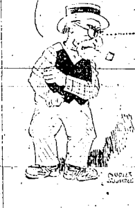
Time Want Ad-Get Health.

THERE GOES TH' GUM WHO BORROWED $20 FROM HIS NEIGHBOR... 'TIS A MINUTE HELD BE STOPPIN' MY FEET WITH HIS NOSE!