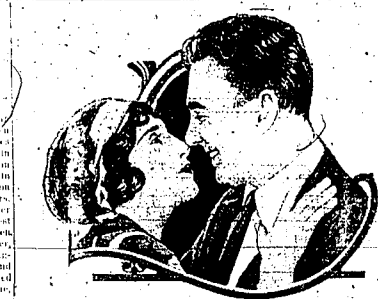
Bebe Daniels and Tom Moore in the Paramount Picture 'Dangerous Money' Appearing at the Idaho Theatre Tonight Only

T. H. Highway _____ Road Trd. Int. Tot. Duh _____ $32 $84 $ 484 Eller Highway _____ 27 68 555 Nortwidge Hwy _____ 25 10 42 37 Stock Creek Hwy _____ 25 10 42 37 Predatory animal tax (on all other live stock) _____ 30 Sheep inspection _____ 30 T. B. eradication (Indian tax on