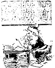
CHRIST'S DIVINITY (Continued from Page 1)