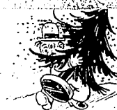
1924 INCREASE (Continued from page 1)