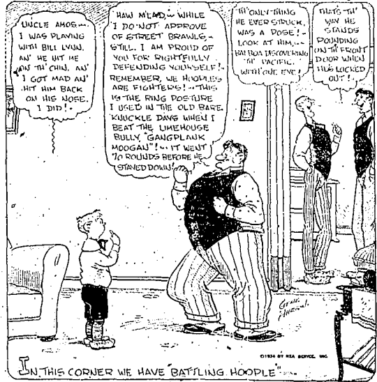
IN THIS CORNER WE HAVE BATTLING HOOPLE