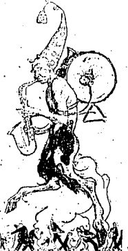
The Great God Pan—1924 Version

JAZZ has brought epileptic convulsions within the reach of all... (text continues with George Ade's commentary on jazz)