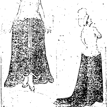
Elizabetta Bonadonna, Screen Star.

THIS beautiful evening gown is a masterpiece of fashion. It is made of the finest brocade and velvet, and is trimmed with the most exquisite of silks.