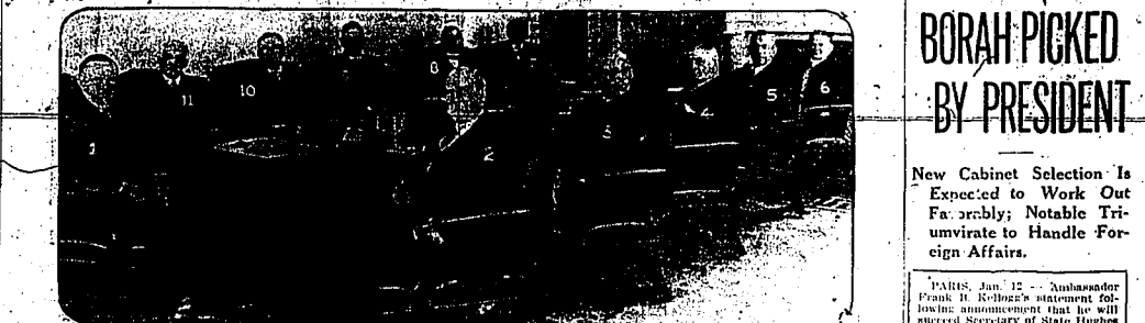
This is the first photo of President Coolidge and his cabinet to be taken since election. 1—President Coolidge; 2—Secretary of State Charles E. Hughes; 3—Secretary of War John W. Weeks; 4—Postmaster General Harry New; 5—Secretary of Interior Hubert Work; 6—Secretary of Commerce Herbert Hoover; 7—Secretary of Labor James J. Davis; 8—Secretary of Agriculture Howard M. Gore; 9—Secretary of the Navy Willard; 10—John W. Weeks; 11—Secretary of the Navy Willard; 12—Secretary of Treasury Mellon.