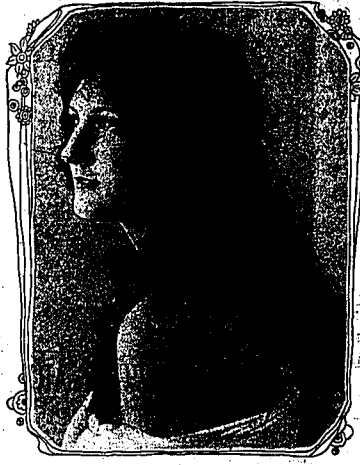
Any Wrong Appetite Is Away From Beauty

Are you, for instance, one of those estimable women who buy their clothes in the "stouts" department, but who find the tea-shops and candy shops along Fifth Avenue, or Michigan Boulevard, or Main Street, well-nigh irresistible? Do you like to spend the afternoon poking lazily about in the shops, winding up in some luncheon room, and "eat" and await a woman friend? Pretty soon one or the other of you will wonder just what you need to try putting the "pet" in "appetite."