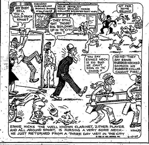
ERNIE HICKS THE WELL KNOWN CLARINET, ZITHER PLAYER AND ALL AROUND SPORT, IS SHOWING A VERY SORE NECK...

For Rent FOR RENT—Housekeeping apart- ments, completely furnished for light housekeeping (one, two- and three- rooms close in, and low rates, by week or month. The Oxford, 423 Main St.