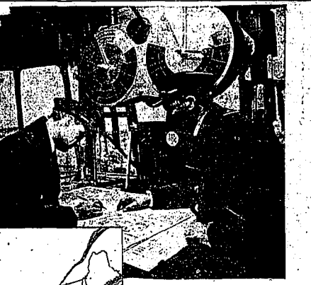
Lieutenants C. E. Rosendahl and J. D. Lawrence, examining a map of the chart table of the Shenandoah.

... aids in navigation should be shown. Each map should show a sufficient amount of adjacent territory along each border, outside of the subject territory so that a course can be laid from one map to the next.