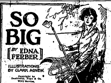
Illustrations by Clark Agnew

"I hope you didn't think it was going to be a picture of a woman buying to be a picture of a woman buying to be a picture of a woman buying..."