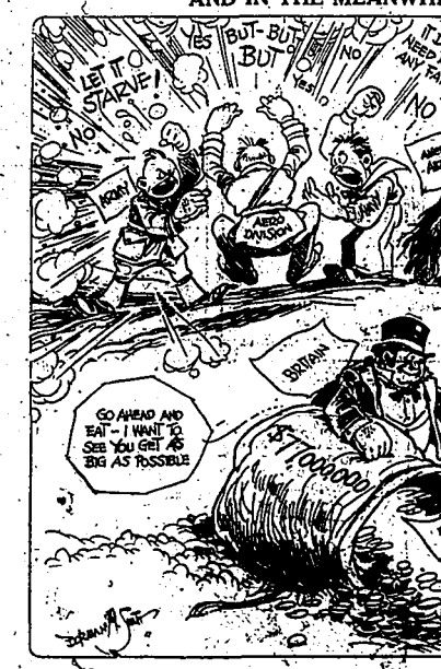
GO AHEAD AND EAT - I WANT TO SEE YOU GET AS BIG AS POSSIBLE