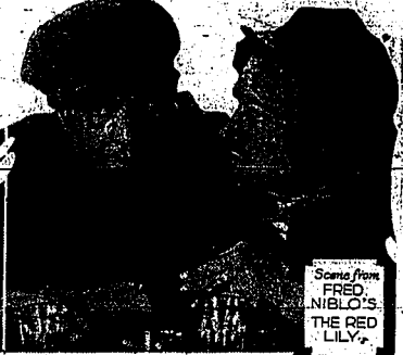
Some from FRED NIBLO'S THE RED LILY.