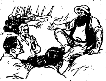
Challenger presided with a solemnity as if he were the Lord Chief Justice on the bench.

When I finished my last letter I stated that we were within a few miles from an attached plateau of high cliffs, which encircled, beyond all doubt, the plateau of which Professor Challenger's expedition seemed to me in some places to be greater than he had stated. The summit showed every sign of insurmountable vegetation, with bushes near the edge, and farther back many high trees. There was no indication of any life that we could see.