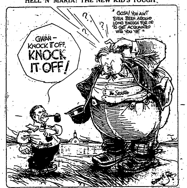
(Continued on page 3.)

LONDON, March 21.—The English prohibitionists today demanded that the government should now pass a prohibition measure.