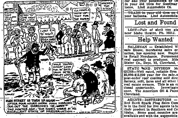
MAIN STREET IS TORN UP AGAIN - THE TOWN IS BEING REBUILT - THE TOWN IS BEING REBUILT - THE TOWN IS BEING REBUILT

WANTED - At once for cash, used Ford car, Phone 1470. J. B. White, 323 Main E.