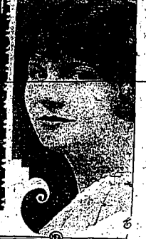
Teachers who picture school with a roll of honor high on their minds...