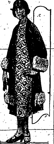
This attractive ensemble has a coat of beige... with fox fur and lined with the same printed silk of which the dress is made.