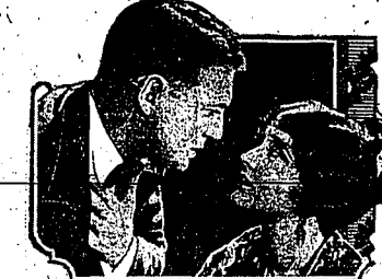
"Richard Dix and Frances Howard" (Sybil's Paramount Picture) "Too Many Kisses"

Merey Preparatory "I have been told" said the football player to his fiancée, "that you have been engaged before; that I am not the first." The intensity of the position he made her shudder, but she quickly recovered herself.