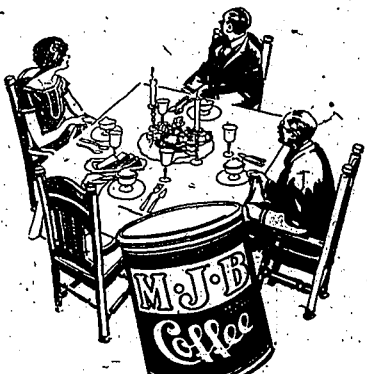
Vacuum packed by a special process invented and owned by M.J.B. This keeps the coffee full strength and flavor-fresh always!

T ABLE TALK may drift from office to opera, from Romeo to radio—but there's one "sending station" on which all the family likes to tune in: M-J-B! For M-J-B meets every taste in coffee. Drink it as you like it—strong, medium or mild—with cream or without.—The same can't-be-beat flavor of M-J-B is always in the cup. A lifetime of coffee experience puts it there.