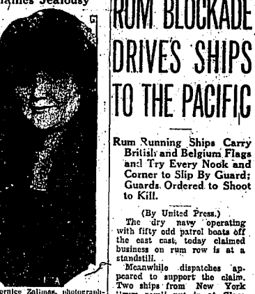
Rum Running Ships Carry British and Belgium Flags and Try Every Nook and Corner to Slip by Guards: Guards Ordered to Shoot to Kill.

Boise Will Get National Guard Encampment for '25