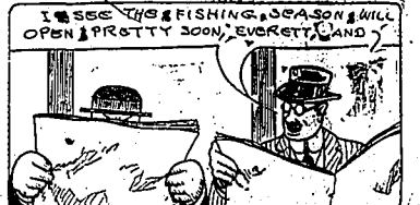
THAT REMINDS ME OF LAST SEASON. I CAUGHT...