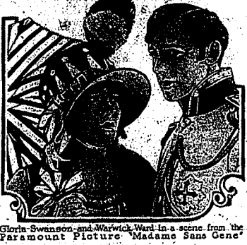
Gloria Swanson and Warwick Ward in a scene from the Paramount Picture 'Madame Sans Gene'

Gloria Swanson, playing the most celebrated of all French roles—"Madame Sans-Gené"—is more beautiful, more popular, more glorious than ever before. You will see her dancing, clowning, mimicking, loving, thrilling as never before in this gorgeous Paramount production, filmed in France against a background of royal palaces and rare art treasures, today tomorrow and Friday at the Idaho Theatre. And the first 200 at the theatre tonight will receive, as souvenir of this momentous picture, metal medallions, bearing Gloria's portrait. The matinee performance of "Madame Sans-Gené" are in every respect as brilliant and elaborate as the evening performance. So don't miss it.