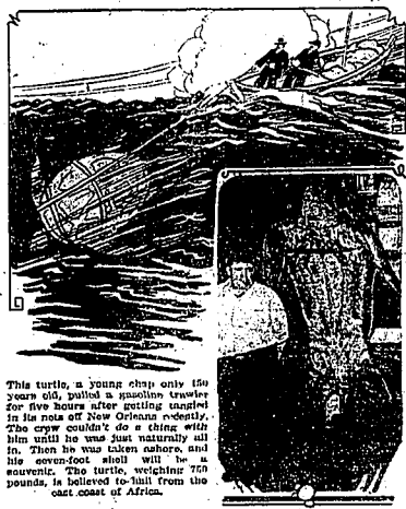
This turtle, a young chap only 150 years old, pulled a mailman's trunk for five hours after getting caught in the net of New Orleans recently. The egg would do a thing with him until he was just naturally all in. Then he was taken ashore, and the seven-foot shell with its four legs, the turtle, weighing 750 pounds, is believed to hail from the east coast of Africa.