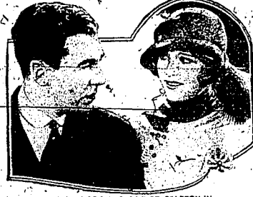
TOM MOORE AND ESTHER RALSTON IN THE PARAMOUNT PICTURE "THE TROUBLE WITH WIVES"