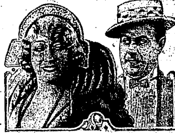
GLORIA SWANSON AND FORD STERLING IN A SCENE FROM THE PARAMOUNT PICTURE 'STAGE STRUCK' AN ALLAN OWAN PRODUCTION.